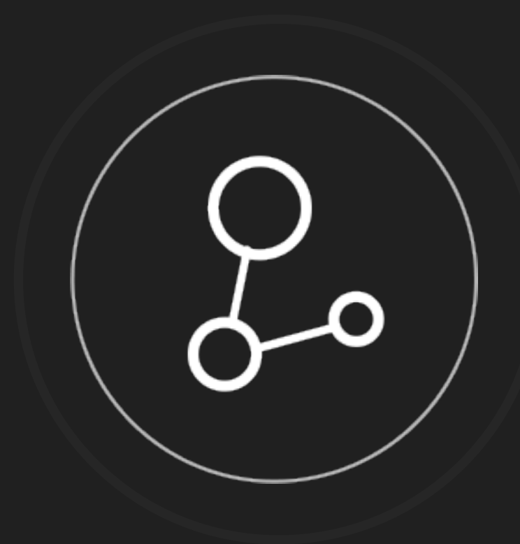
Works With Mi Devices