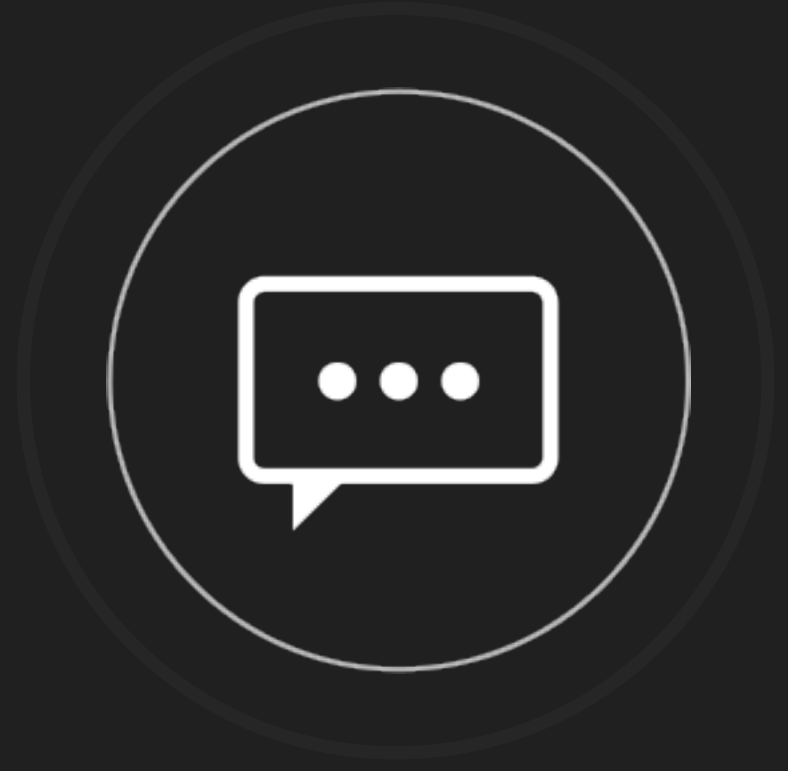
Leave Home Reminders