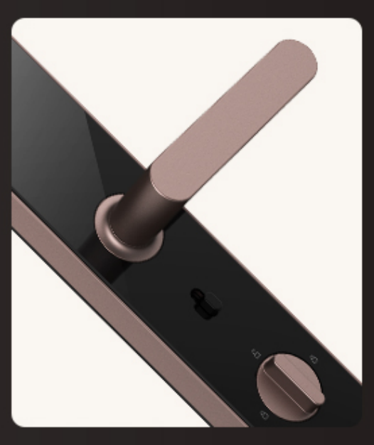
Integrated handle design