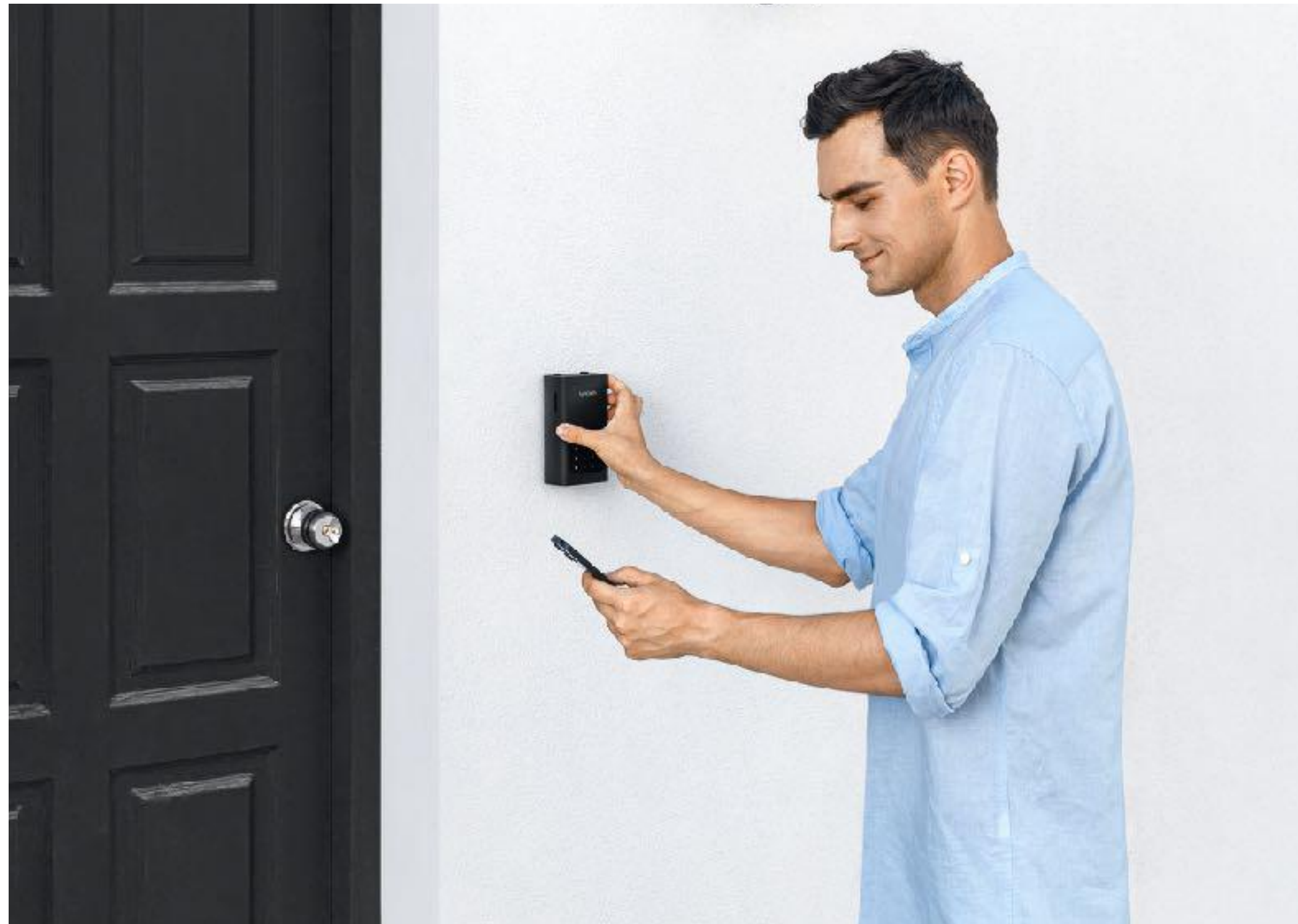
Unlock Via App