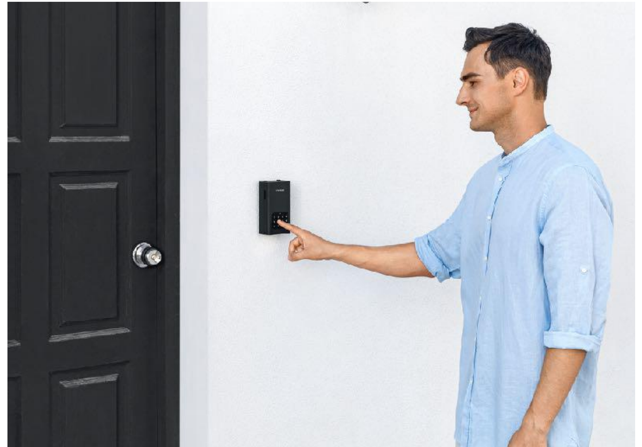
Unlock Via Code