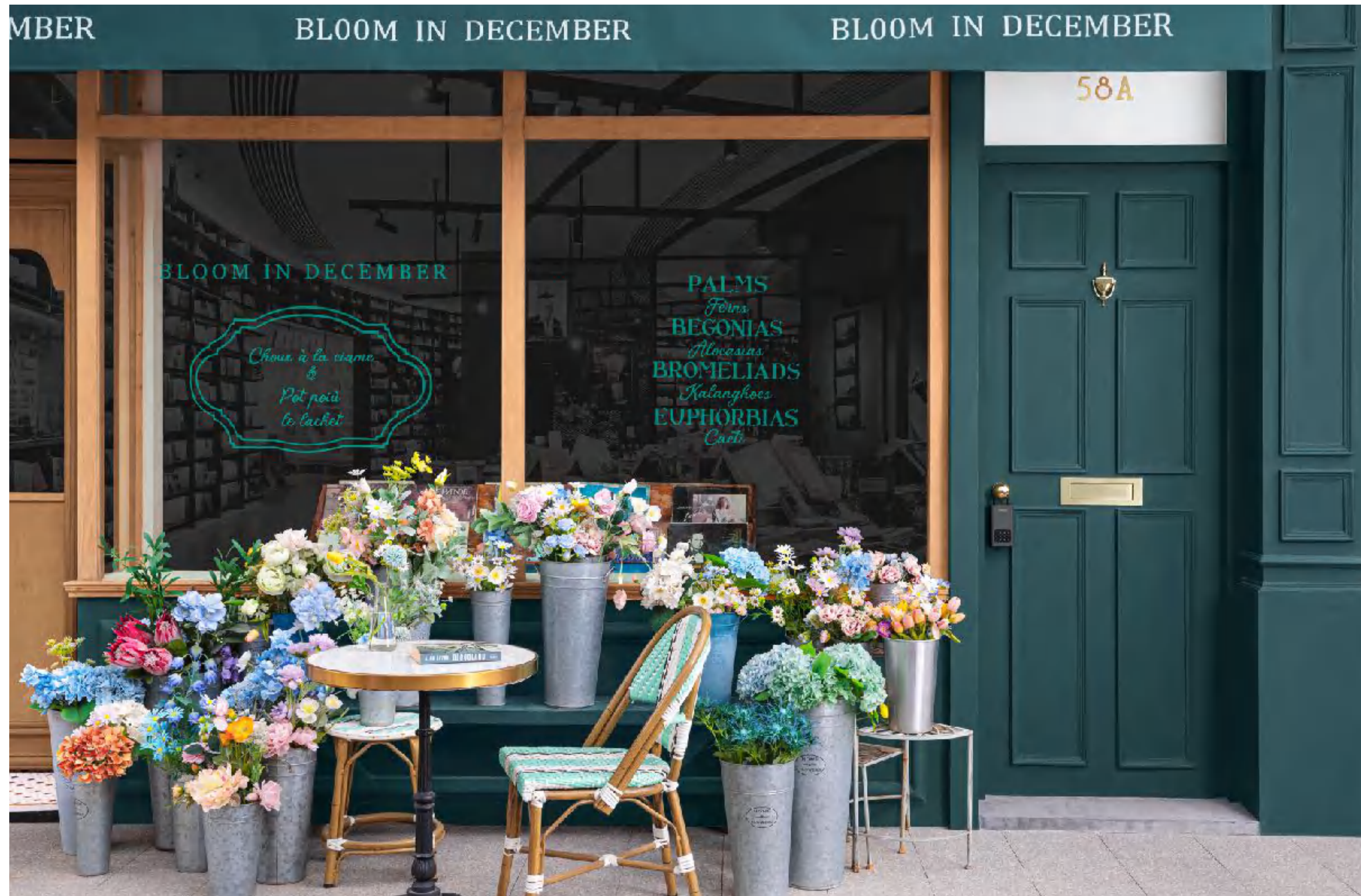
Smart Lockbox for Business