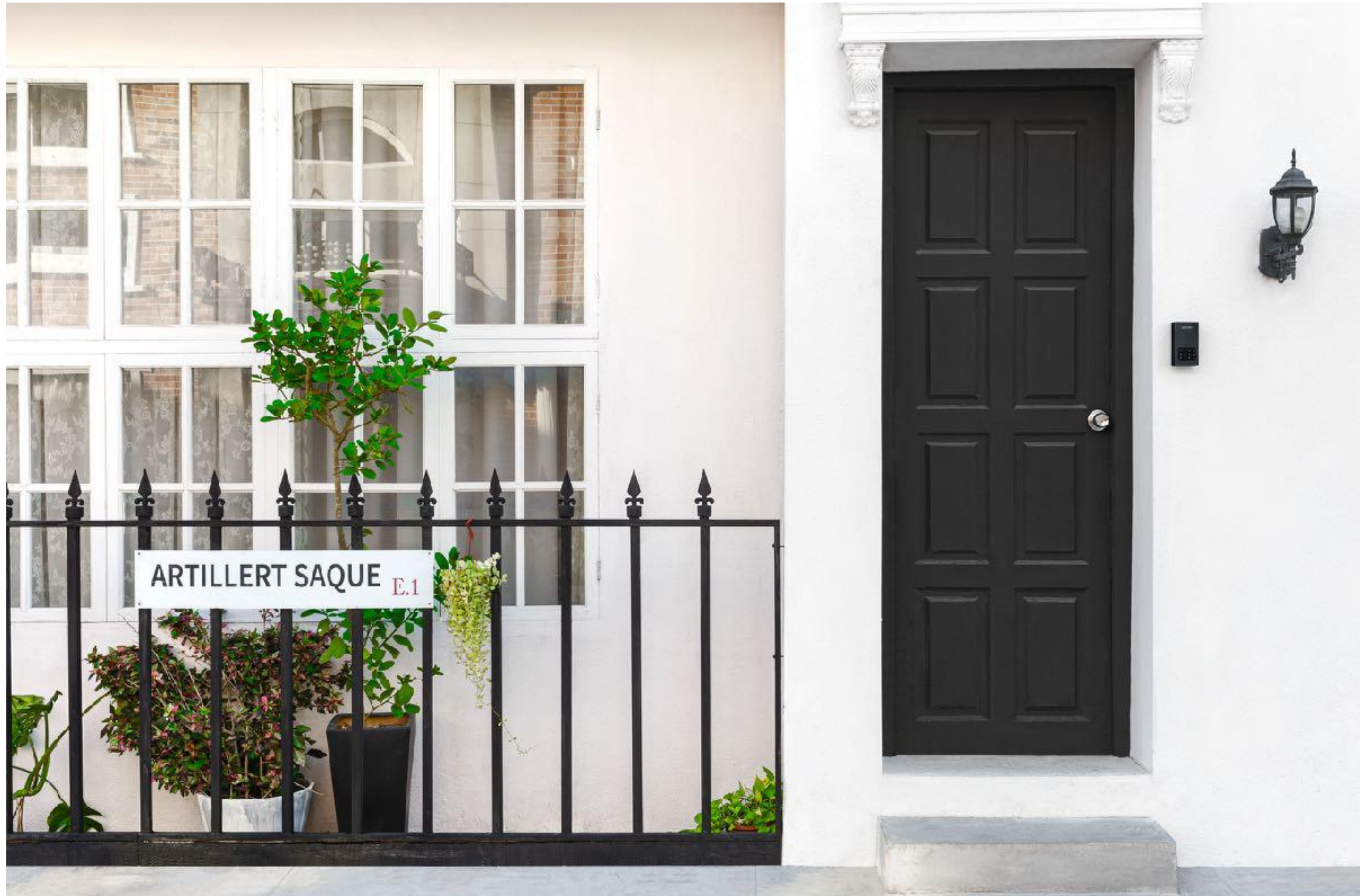
Smart Lockbox for Home